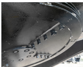
Replaceable carbide teeth on bottom of blade carrier.