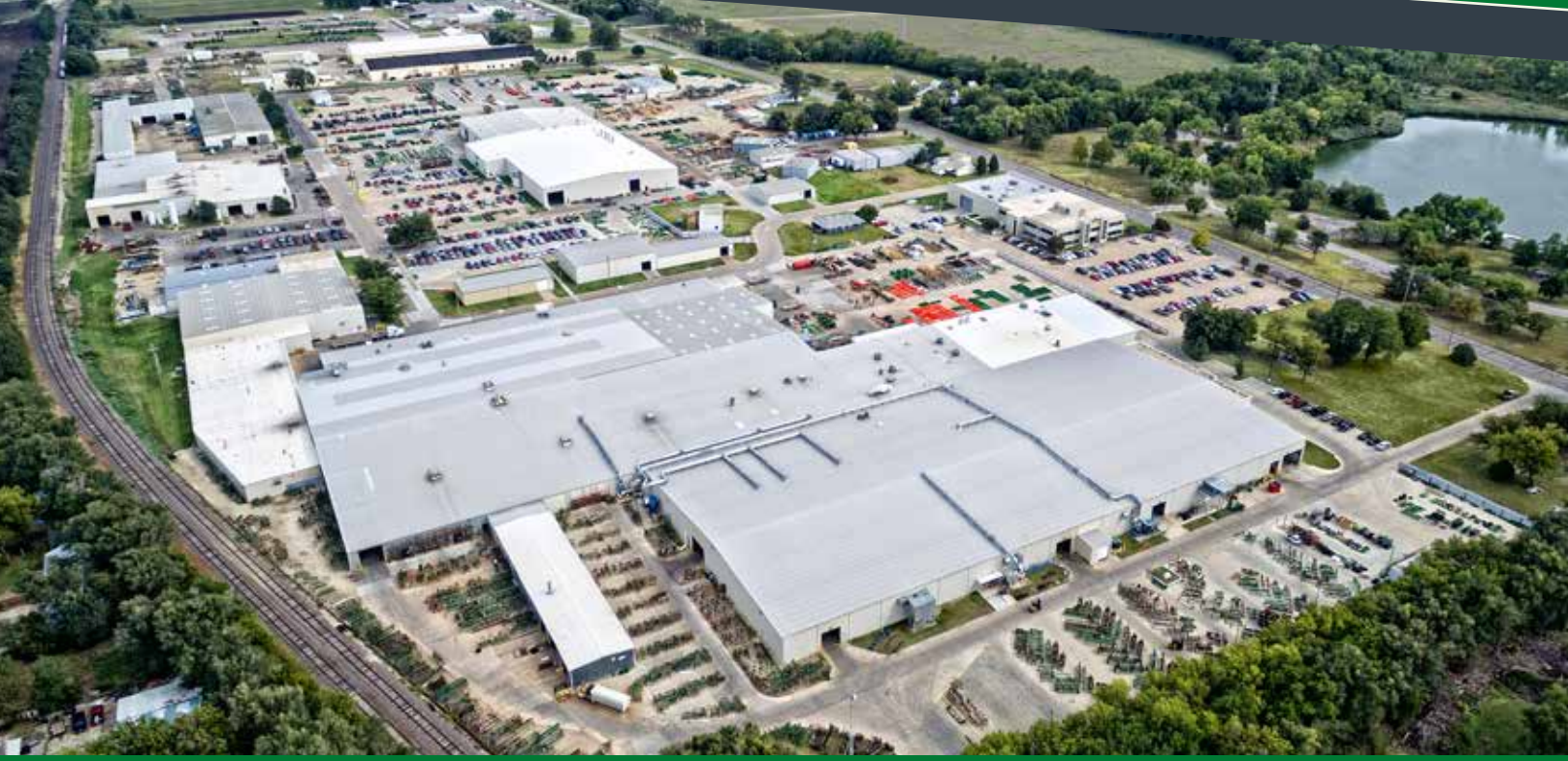
SALINA CAMPUS | SALINA, KS