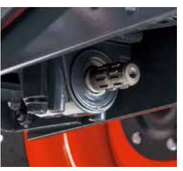
*Not available on B3150Sl

The offset PTO allows quick installation and removal of the mid-mount mower.