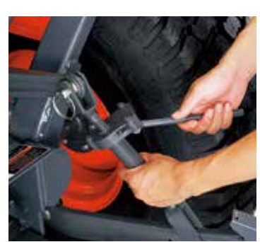
*Optional on B3150S

Ratchet-type lift rod allows speedy adjustments to 3-point mounted implements. Lift rod adjustments can be made with ease.