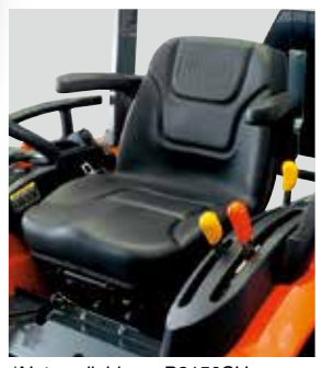
*Not available on B3150SU

The new suspension seat is specifically designed to absorb shock reducing operator fatigue to make your ride comfortable no matter what the conditions. Arm rests are standard equipment for added comfort.