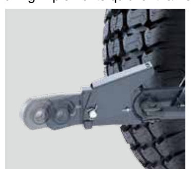
*Optional on B3150SU

Intelligently designed telescopic lowerlink ends make attaching and detaching implements quicker than ever.