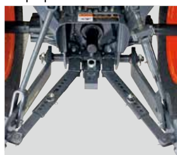
*Not available on B3150SU

Easily adjust the horizontal sway of the implement by aligning and setting the pin in the proper hole.